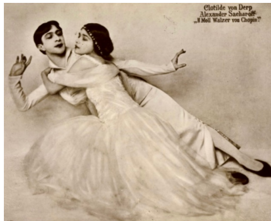
Alexander Sacharoff & Clotilde von Derp: „H Moll Walzer von Chopin“