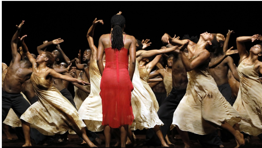
Pina Bausch: „Das Frühlingsopfer“